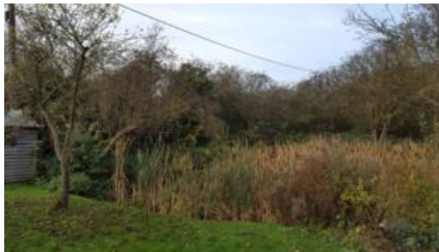
Western tree and scrub edge