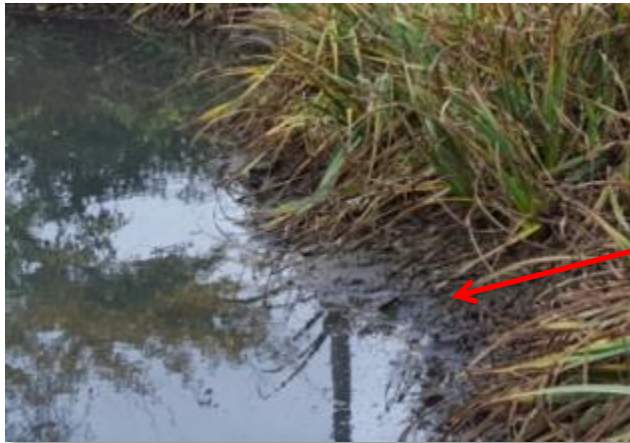
Accumulated organic matter (leaf litter)