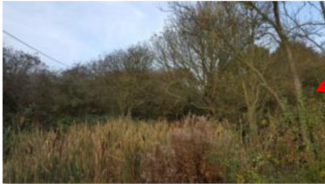
Eastern tree and scrub edge

Scrub is an incredibly important habitat in its own right, providing a continued source of nectar, fruit, seeds, shelter, breeding and roosting sites for birds, invertebrates, amphibians and small mammals and should therefore be managed sensitively so that optimal areas of habitat are available at all times.