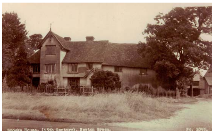
Brooke House, (15th Century), Newton Green.

A Grade II listed building occupying a prime site on the north-east side of the Green, this is a 16-17 th Century timber-framed and plastered house, restored and renovated in the 20 th Century with modern doors and windows but in style. A narrow gabled 3 storey wing projects on the front, probably a staircase wing added in the 17 th Century. The upper storey is jettied on the north-west side of the front on either side of the wing, on exposed joists.